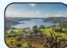
5 Lake Windermere