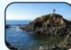
4 Giant's Causeway