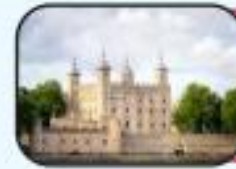
1 Tower of London