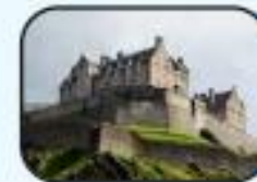
3 Edinburgh Castle