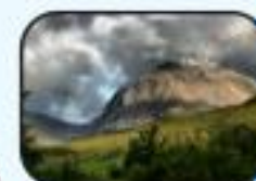
6 Ben Nevis