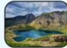
2 Yr Wyddfa (Mount Snowdon)