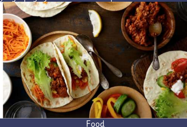
Corn, beans, avocados, tomatoes, rice, chilli