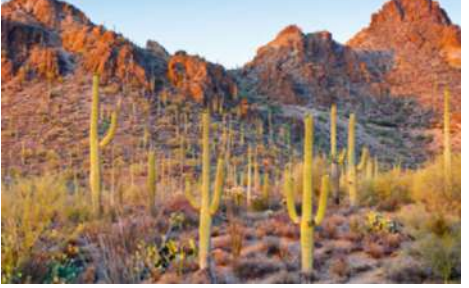
The Copper Canyon